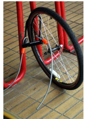
How not to lock your bike up.

Always lock your bike in a visible, well lit, high traffic area. Lock your bike to an immovable object such as a bike rack that is anchored to the ground. Do not lock your bike to items that can be readily cut, broken or removed. Speak with your local bike shop for advice on the type of lock for your bike.